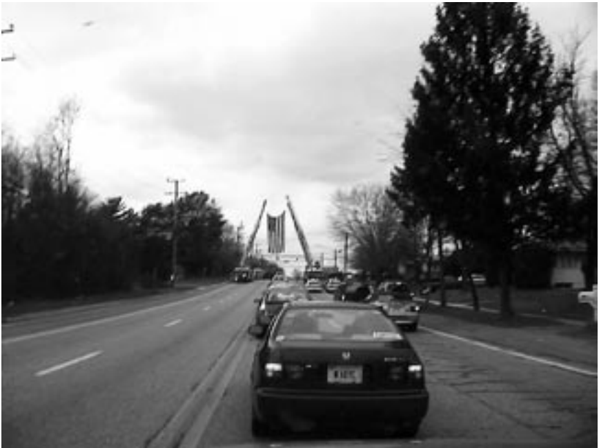
Photo taken from the funeral procession at Liberty Road and the entrance to the cemetery.